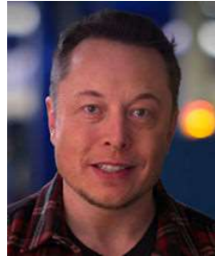
Elon Musk SpaceX / Tesla