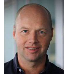
Max Tegmark Professor, MIT