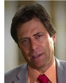
Sebastian Thrun Cofounder, Udacity