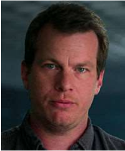
Jonathan Nolan Writer / Director