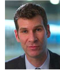
Peter Singer Author, Wired for Wa