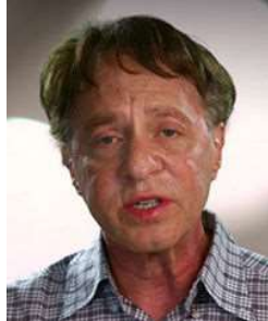
Ray Kurzweil Futurist