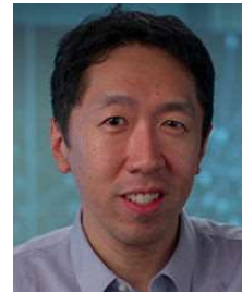
Andrew Ng Cofounder, Google Brain 2011-12