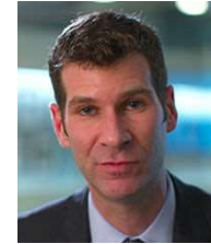
Peter Singer Author, Wired for Wa