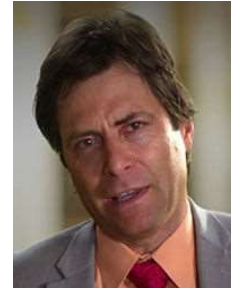
Sebastian Thrun Cofounder, Udacity