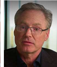
Eric Horvitz Director, Microsoft Research Lab