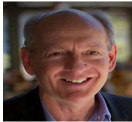
Ray Stuart Russell Professor, UC Berkeley Kurzweil Futurist