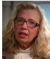
Christine Fox Deputy Secretary of Defense, 2013-14