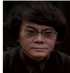
Hiroshi Ishiguro Professor, Osaka University