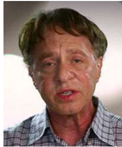
Ray Kurzweil Futurist