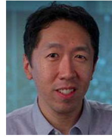
Andrew Ng Cofounder, Google Brain 2011-12